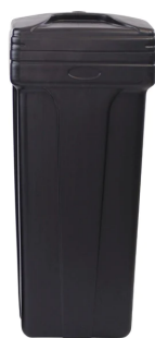
Black Square Tank