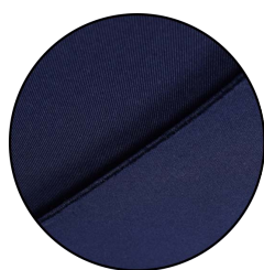
Navy Blue Neoprene

Available in Blue or Gray Neoprene, Chrome or White Plastic